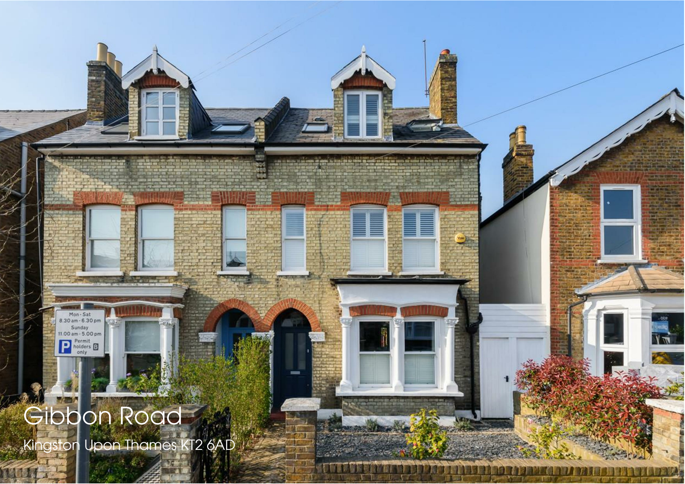
Gibbon Road Kingston Upon Thames KT2 6AD

34 Richmond Road Kingston upon Thames Surrey KT2 5ED www.gibsonlane.co.uk Tel: 020 8546 5444